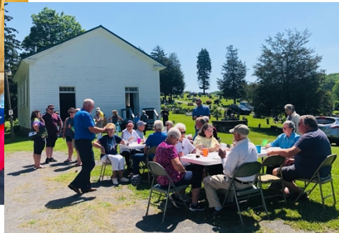
Event attendees enjoy the social hour outside the Advent Church