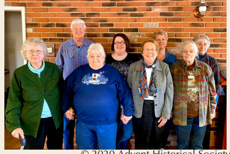
2020 Advent Historical Society

www.facebook.com/AdventHistoricalSociety